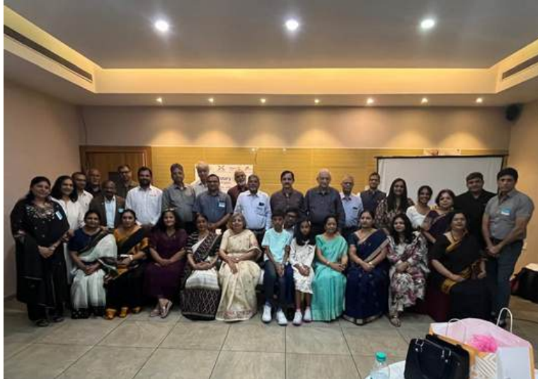
Weekly Meeting on August 09, 2024