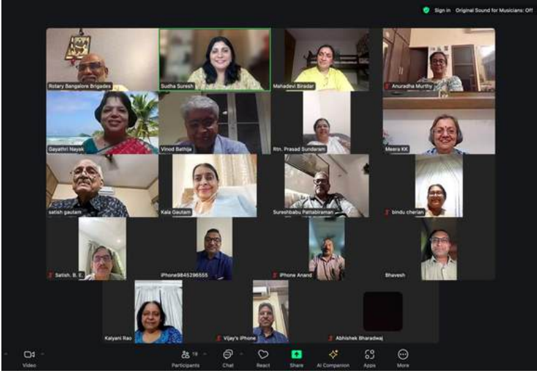
Weekly Meeting on August 02, 2024