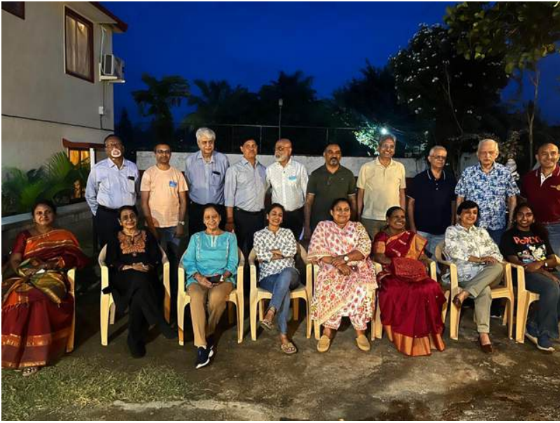
Joint Meeting with Rotary Club of Yelagiri on August 31, 2024