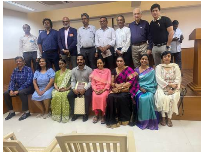
Joint Speaker Meeting with Rotary Bangalore Ulsoor Rotary Bangalore Manyata & Rotary Bangalore Rajajinagar